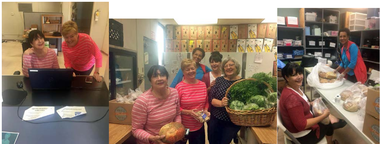
Make A Difference Day – Anaheim Club feeds the Hungry at the HUB of Hope in Fullerton.